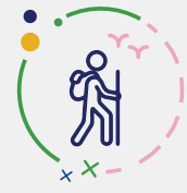
Moderate to vigorous activity