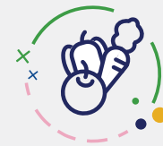
Chores, such as carrying groceries