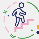
Walking, climbing stairs, or kneeling